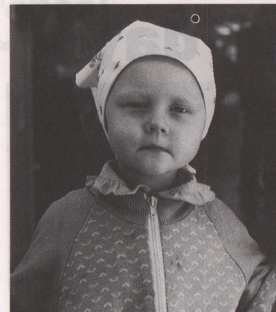
One of the many children who will benefit from Irish CND's fundraising and support work.

Travelling with them is a team of mechanics who will instruct the hospital on how to service and