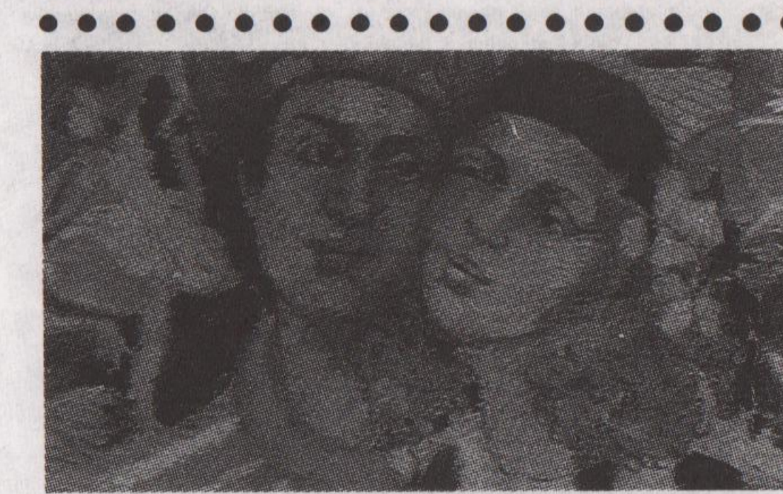
The time, the place by Olwen Tarrant

Please remember: the deadline for registration with accommodation is Friday 4 November, without accommodation the deadline is Friday 18 November.