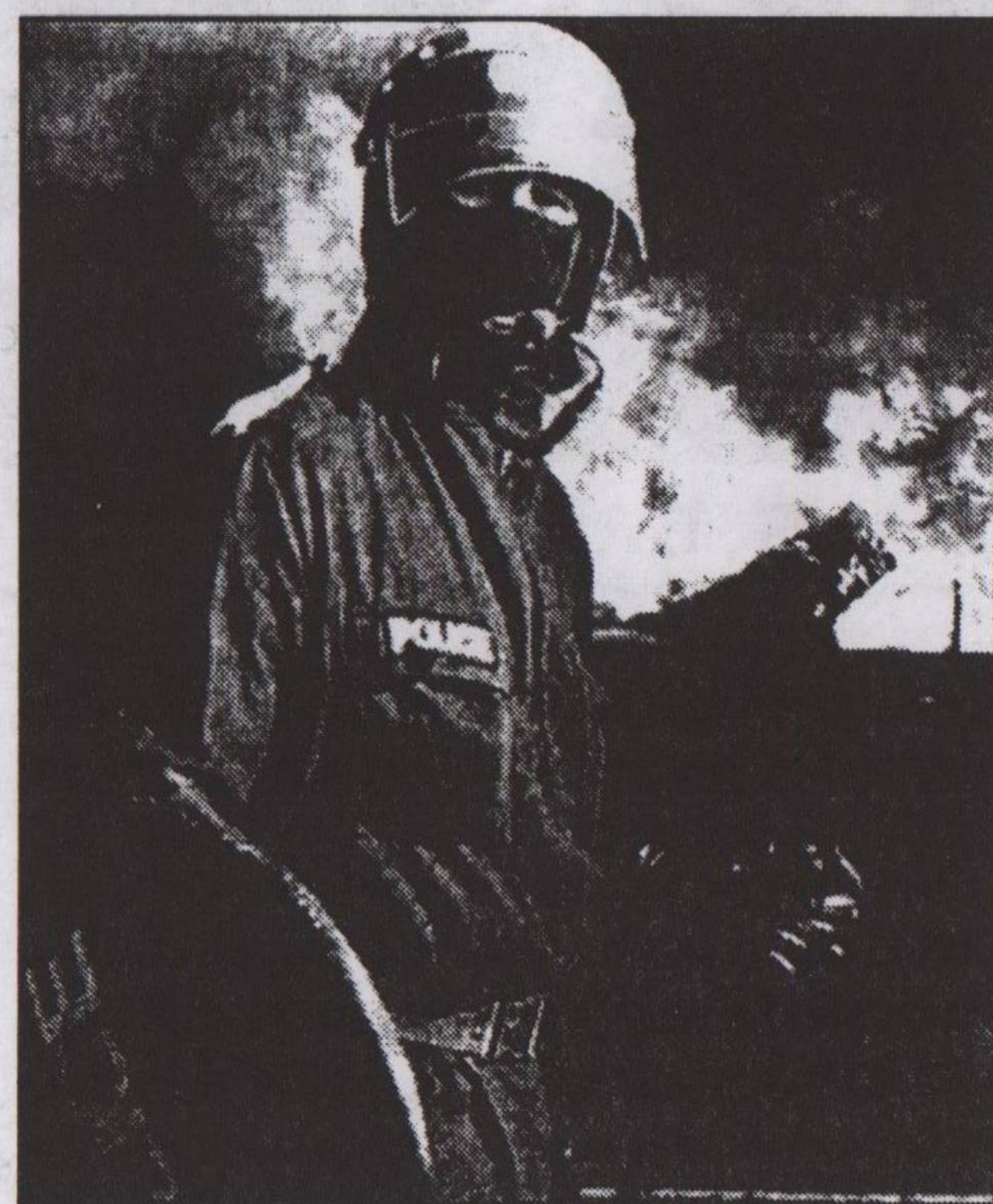
A minority of masked thugs came prepared for trouble

While world leaders were plotting our fates they lost control of the city and some of London's coppers got the kicking they deserve. Damage to the city was put at over £5,000,000 - a good days work.