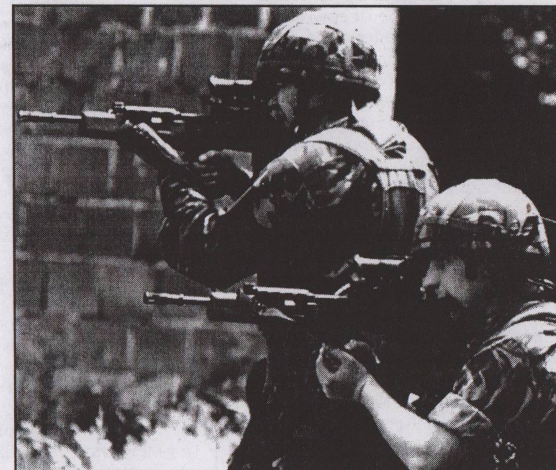
Thanks to the MoD for this picture of British troops in Kosovo

The KLA carried out murders of both Gypsies and muslim Kosovan Serbs from 1997 onwards. They press ganged Kosovar Albanians and with the retreat of Serb forces have continued to massacre local Serbs and gypsies. The KLA dreams of a greater Albania. This