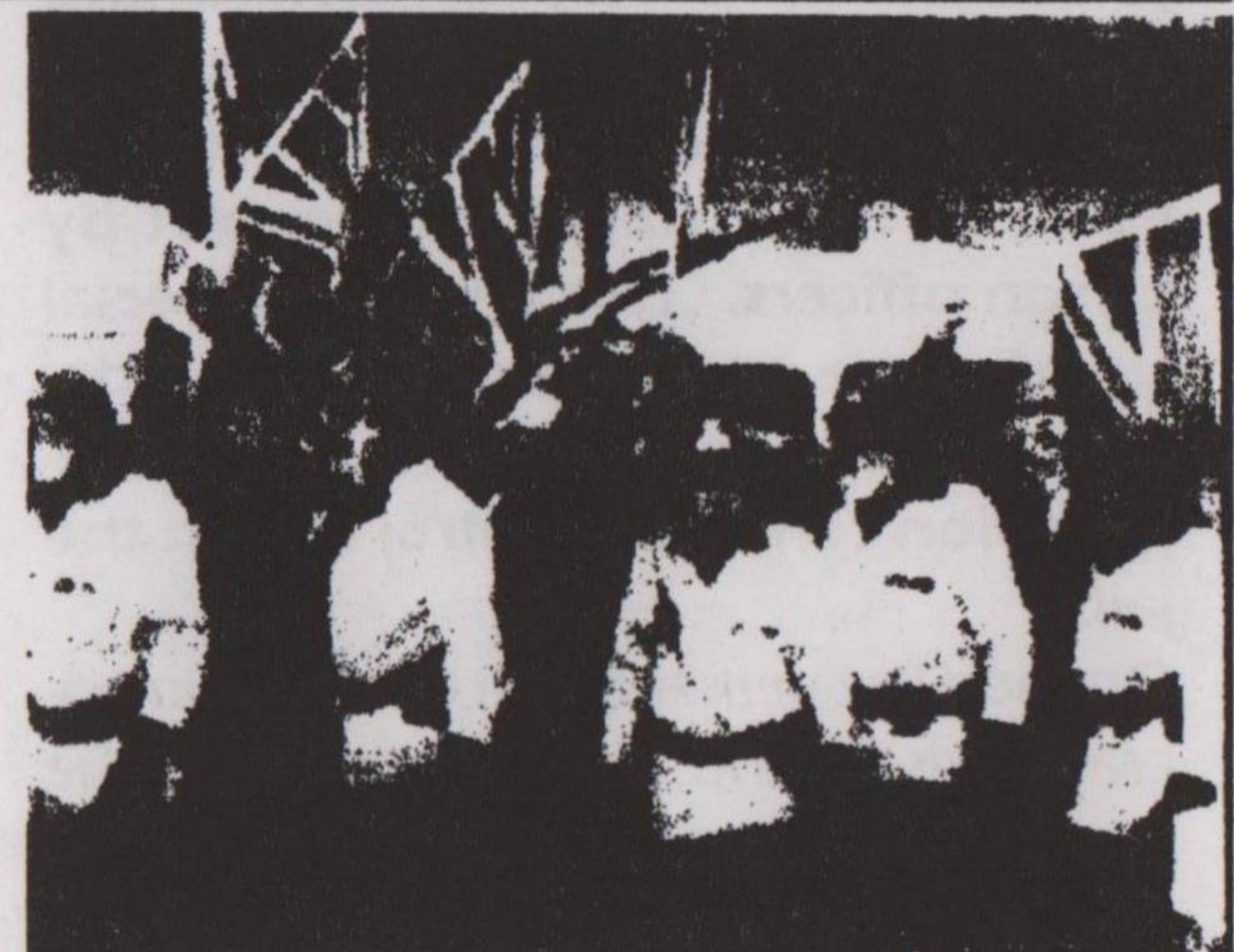
Fascist thugs protected by racist thugs in Dover this January.

The campaign against the National Front in Dover has it's own website at: http://www.canterbury.u-net.com/Dover.html ★