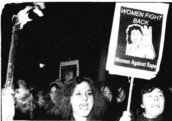
Women march in Leeds

WOMEN took to the streets of Leeds in January in a show of strength and solidarity. After a series of rapes and assaults women have received scaremongering 'advice' from media and police to stay at home and never travel alone. A busy junction was blocked for half an hour by demonstrators asserting their freedom to travel wherever, whenever and however, in safety.