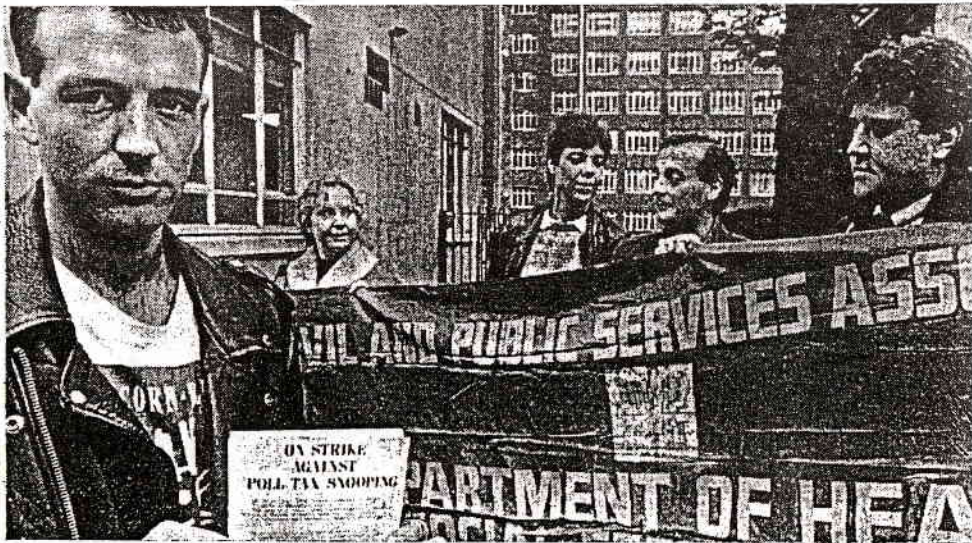
Striking dole office workers refuse to be poll tax snoopers

Organising against poll tax-driven council cuts means organising against the council. Those councillors who stay