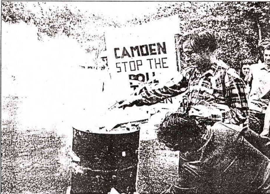
Burning poll tax registration forms in London