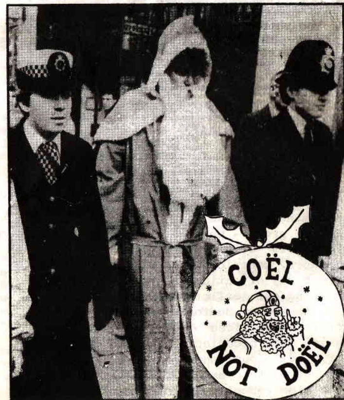
CHRISTMAS SPIRIT: Santa Claus was arrested outside Hamley's toy shop in Regent Street, London, yesterday, while he was launching a Christmas toy appeal for miners.

the government has sensed that the time is approaching when the striking miners will need to call upon all their support for the final battle against Scab Coal.