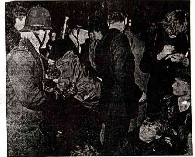
FLASHPOINT: Police take away students after clashes on Westminster Bridge

head of the Outer Citizens Army? Are the same destabilisation tactics about to be employed once again? An increase in sectarian violence only benefits the British state, that can use such an escalation to its advantage.