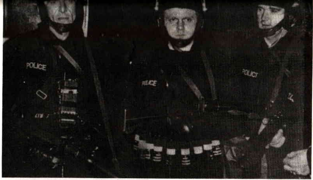
Armed police agitators in Tottenham.

It is the fear of working class solidarity or mutual aid that prompts the press to