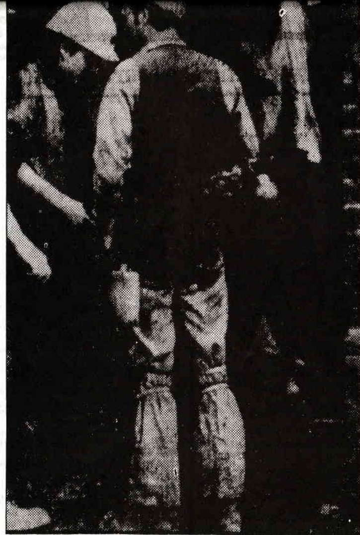
Goodbyes at the last production shift at Cortonwood pit.

Solidarity actions against the Dutch State were done in Frankfurt and Berlin at the time of this article.