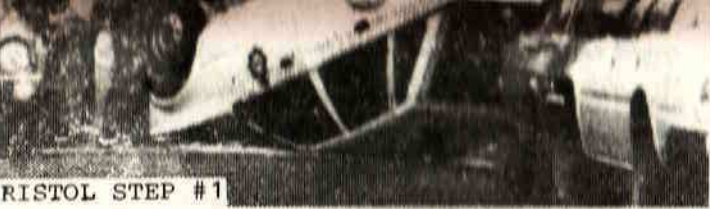
BRISTOL STEP #1

On Friday evening February 7th, cops chasing a runaway car crashed their motor in St Pauls, Bristol. Surrounded by a mob of 150 masked and balaclava'd youths, they fled the area-the mobile Sty was overturned. As darkness arrived with the cops no-where to be seen petrol was poured over the wreck and it was torched...it was totally gutted. We suspect that this was just the beginning as far as Bristol's concerned-there's a lot more on the way.