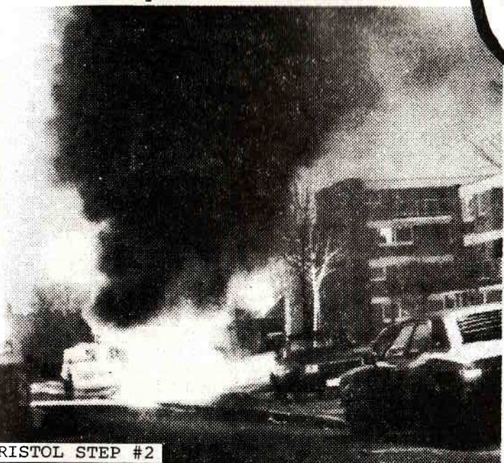
BRISTOL STEP #2

On Friday evening February 7th, cops chasing a runaway car crashed their motor in St Pauls, Bristol. Surrounded by a mob of 150 masked and balaclava'd youths, they fled the area-the mobile Sty was overturned. As darkness arrived with the cops no-where to be seen petrol was poured over the wreck and it was torched...it was totally gutted. We suspect that this was just the beginning as far as Bristol's concerned-there's a lot more on the way.