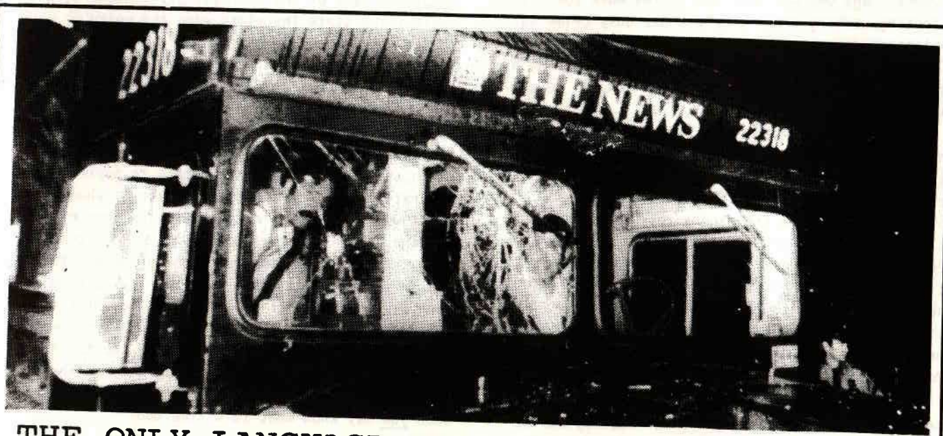
THE ONLY LANGUAGE THAT SCABS UNDERSTAND!

The only way Murdoch will be defeated is by all-out industrial warfare