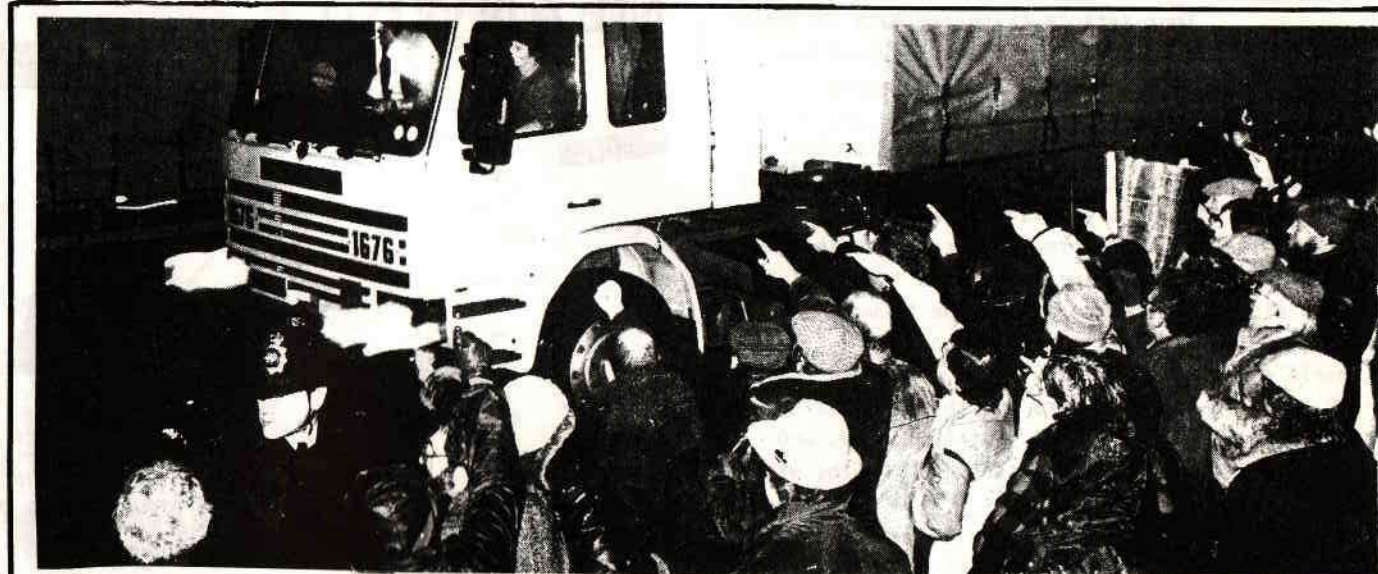
BIG MONEY NOW SCABS, BUT WHAT ABOUT IN 2 YEARS TIME?

The dispute has been in the offing for quite a while. In the USA, all newspapers are hi-tec, while in British printing, only Fleet St. has resisted management imposed new technology. On The Kent Messenger and The Nottingham Evening Post management have won battles in the last couple of years over new technology, sacking printers and replacing them with NUJ scabs. Most importantly in 1983 Eddie Shah destroyed the power of the local NGA, following a sacking dispute at his free rag the Stockport Messenger. After riotous mass pickets and massive fines for secondary picketing, the NGA leadership bottled out and accepted defeat. On Fleet St. itself Maxwell got rid of 2000 printers a couple of months ago. But it is Shah's new daily (to appear by the summer) that has really led to the current crisis. Shah is threatening to sell his colour daily for as little as 10p., which he will be able to afford because of the amount of cost cutting technology and new work practices he has used. In the 'soon to come' price /costs war on Fleet St. Murdoch has moved first.