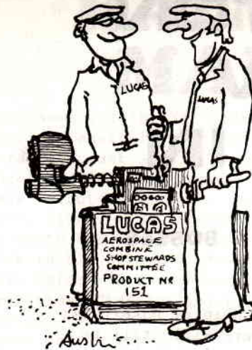
"It's a socially useful device for use on the management"

tarist movement will get round to sabotage, despite the risks. Here in the UK you risk arrest for criminal damage, at the other end of the journey is someone being killed or tortured.