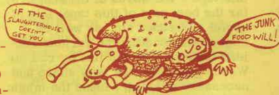
Animals are tortured, murdered for needless consumption.

For £5.00 we'll post 10 issues to you. Write for a subscription to: Green Anarchist. 19 Magdalen Road, Oxford. OX4 1RP.