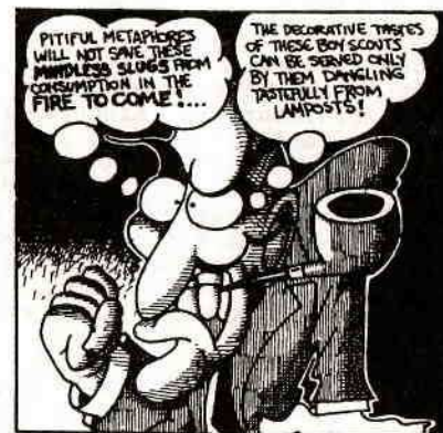
THE MISERY OF REFORM, THE REFORM OF MISERY.

"WHEN THE PROLETARIAT DISCOVERS THAT ITS OWN EXTERNALISED POWER COLLABORATES IN THE CONSTANT REINFORCEMENT OF CAPITALIST SOCIETY. NOT ONLY IN THE FORM OF ITS LABOUR BUT ALSO IN THE FORM OF UNIONS, OF PARTIES, OR OF THE STATE POWER IT HAD BUILT TO EMANCIPATE ITSELF, IT ALSO DISCOVERS FROM CONCRETE HISTORICAL EXPERIENCE THAT IT IS THE CLASS TOTALLY OPPOSED TO ALL CONGEALED EXTERNALISATION AND SPECIALIZATION OF POWER. IT CARRIES THE REVOLUTION WHICH CANNOT LET ANYTHING REMAIN OUTSIDE OF ITSELF, THE DEMAND FOR THE PERMANENT DOMINATION OF THE PRESENT OVER THE PAST, AND THE TOTAL CRITIQUE OF SEPERATION. IT IS THIS THAT MUST FIND ITS SUITABLE FORM IN ACTION. NO QUANTATIVE AMELIORATION OF ITS MISERY, NO ILLUSION OF HIERARCHIC INTEGRATION IS A LASTING CURE FOR ITS DISSATISFACTION, BECAUSE THE PROLETARIAT CANNOT TRUELY RECOGNISE ITSELF IN A PARTICULAR WRONG IT SUPPERED NOR IN THE RIGHTING OF A LARGE NUMBER OF WRONGS EITHER, BUT ONLY IN THE ABSOLUTE WRONG OF BEING RELEGATED TO THE MARGIN OF LIFE."