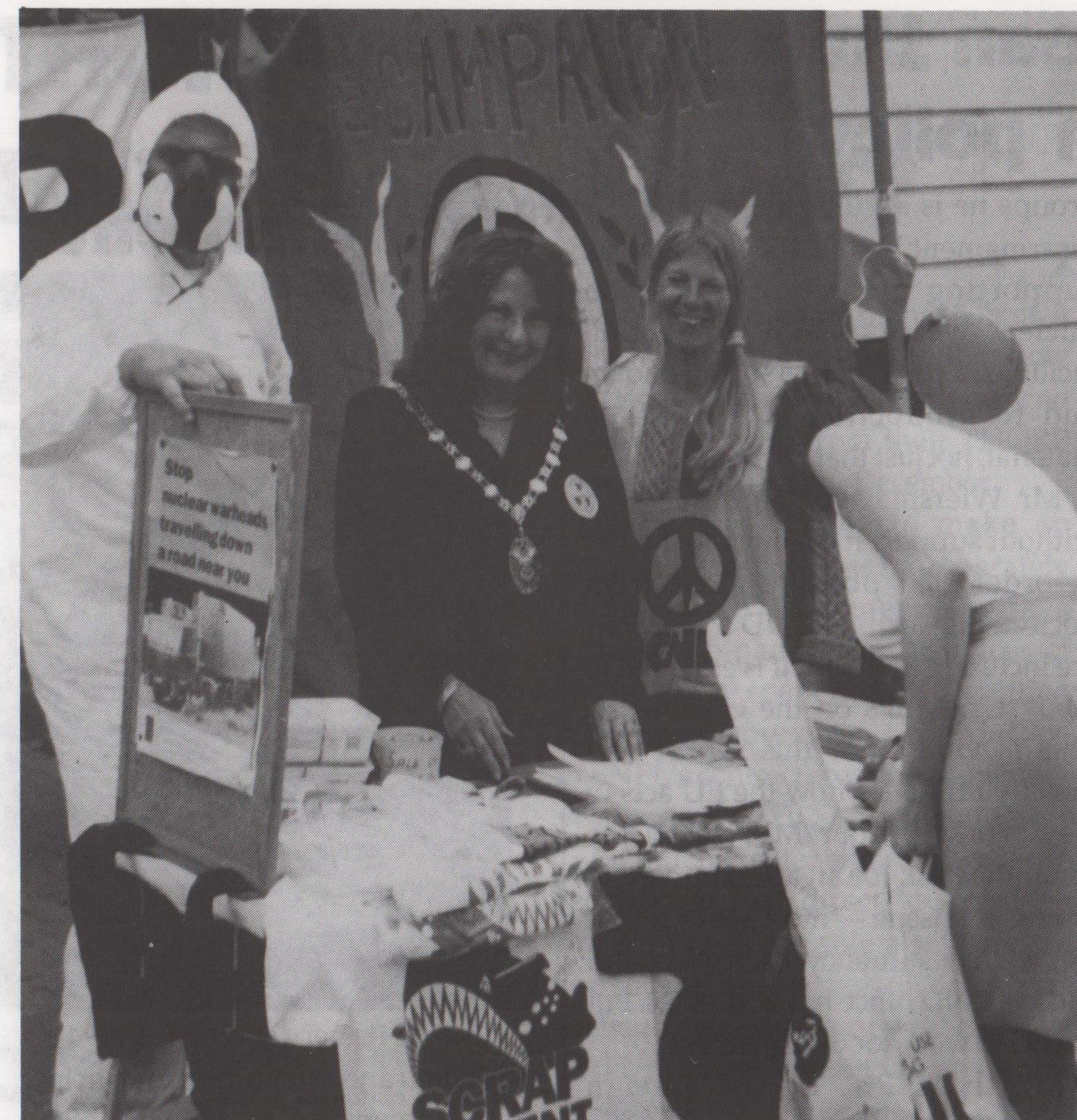
Don't quit stalling...

● Order copies of our Petition for a Nuclear Weapons-Free World and collect as many signatures as you can. Also ask local groups to sign the Charter which