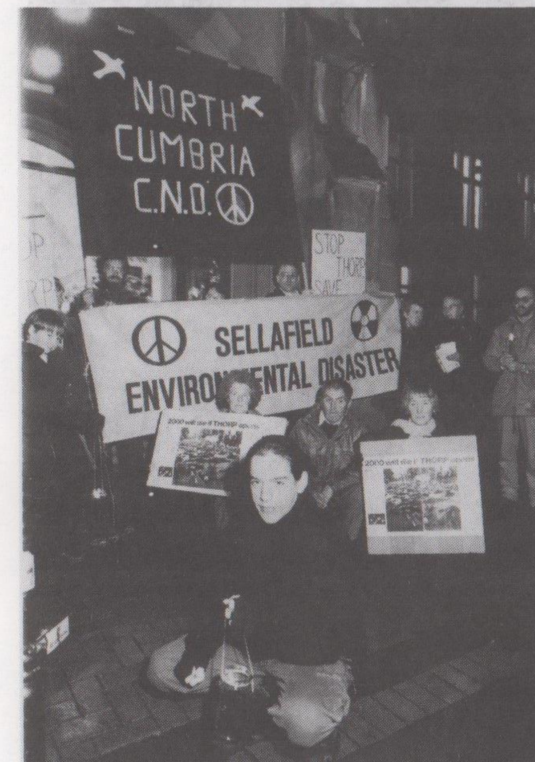
Protesters against THORP in Carlisle.