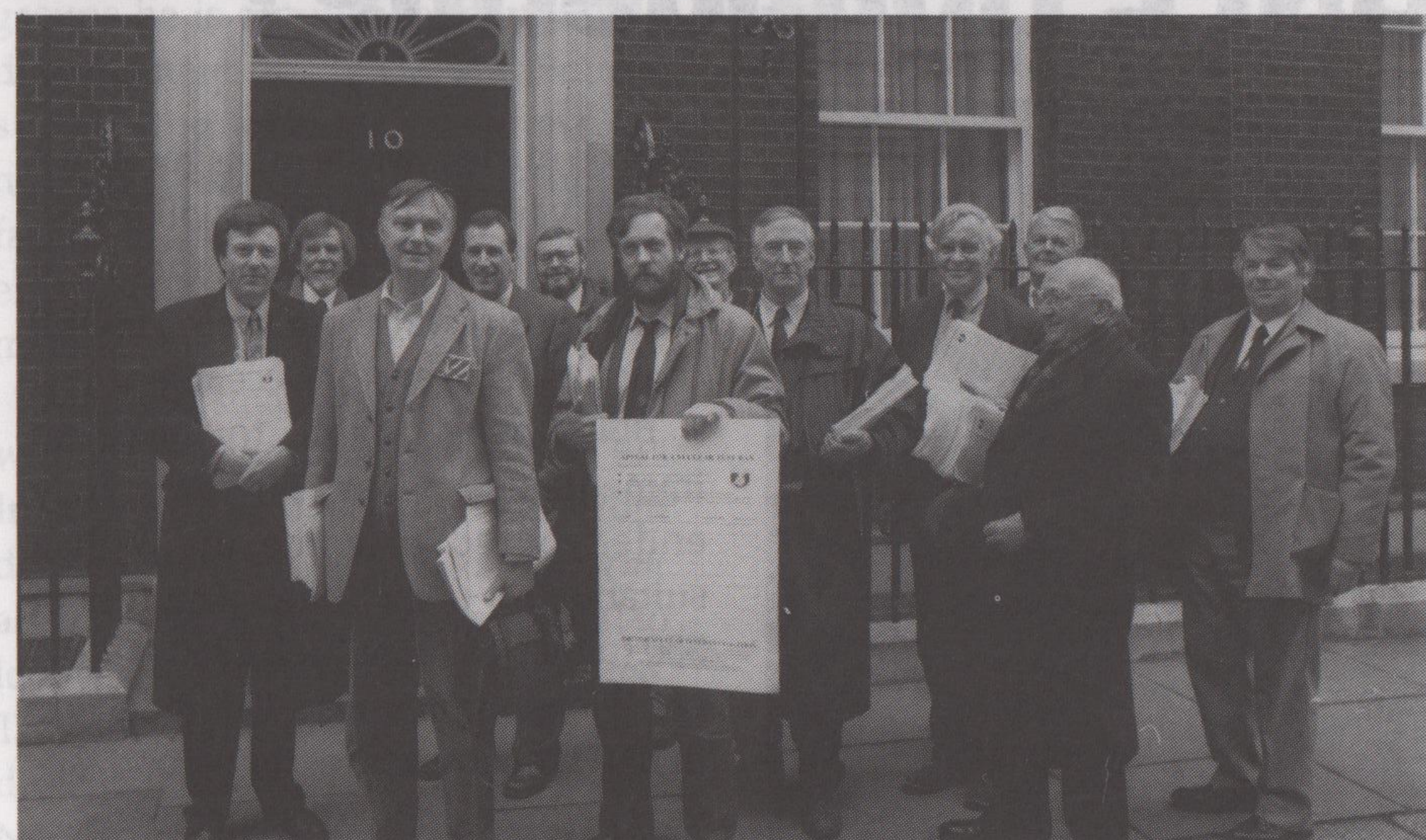
British MPs call for a nuclear test ban

Little progress was achieved. Russia did concede ground on its (minimalist and low-cost) verification preferences, resulting in almost complete agreement on the technologies needed to supplement seismic monitoring. Deep divisions remain, however, over the financial and technical responsibilities of States Parties, and political responsibilities (for interpretation of data) of the implementing agency. The US is widely regarded as taking a particularly unsympathetic view of developing states' concerns over their