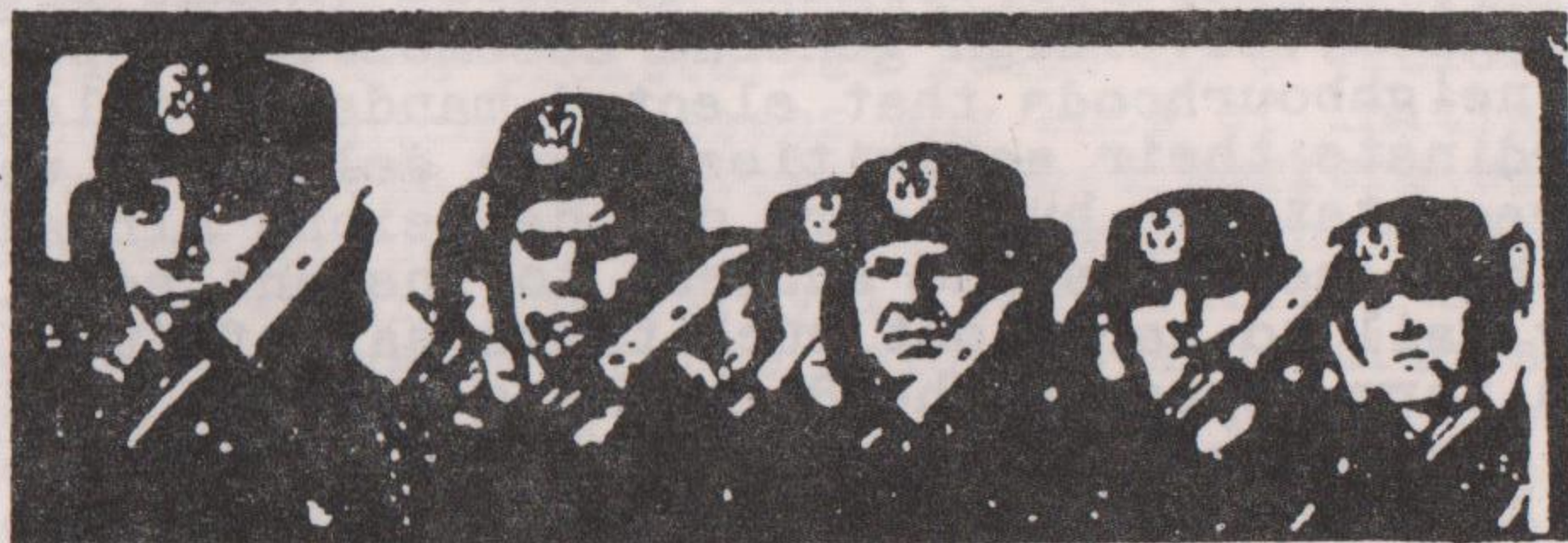
I would like further details of the Communist Party's Democratic Policing Strategy.

Communism is often misrepresented, by 'communists', as merely the equal distribution of those commodities produced by society. This false representation wasn't helped by Trotsky's attempted militarisation of labour (7) or Lenins eager advocacy of Taylorism and 'scientific management' - both claiming that their campaigns were in the interests of socialism. Likewise the dichotomy of Bolshevism against Left-communism is often presented merely as a problem of choice between two competing systems of management. It is vital that we understand that is not a more equal management of the world as it is. It is the total transformation of social relations through the destruction of capitalist relations of production.