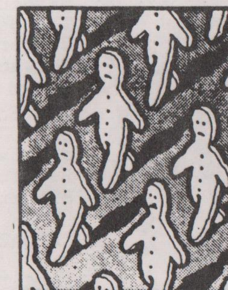
Young Socialists on the march for Socialist Policies.

Faced with the pre-packaged ideologies of the Bolshevik groupings, each claiming to be objectively, scientifically and historically correct most people choose one of these two barren options. But the reason most cadres belong to one Party rather than another has more to do with who they know and like than any 'objective' correctness. There is a sincere and strong desire to destroy capitalism and the injustice, irrationality and poverty of life under it. But for most cadres burned out cynicism is the end of the short road of narrow sectarian fanaticism.