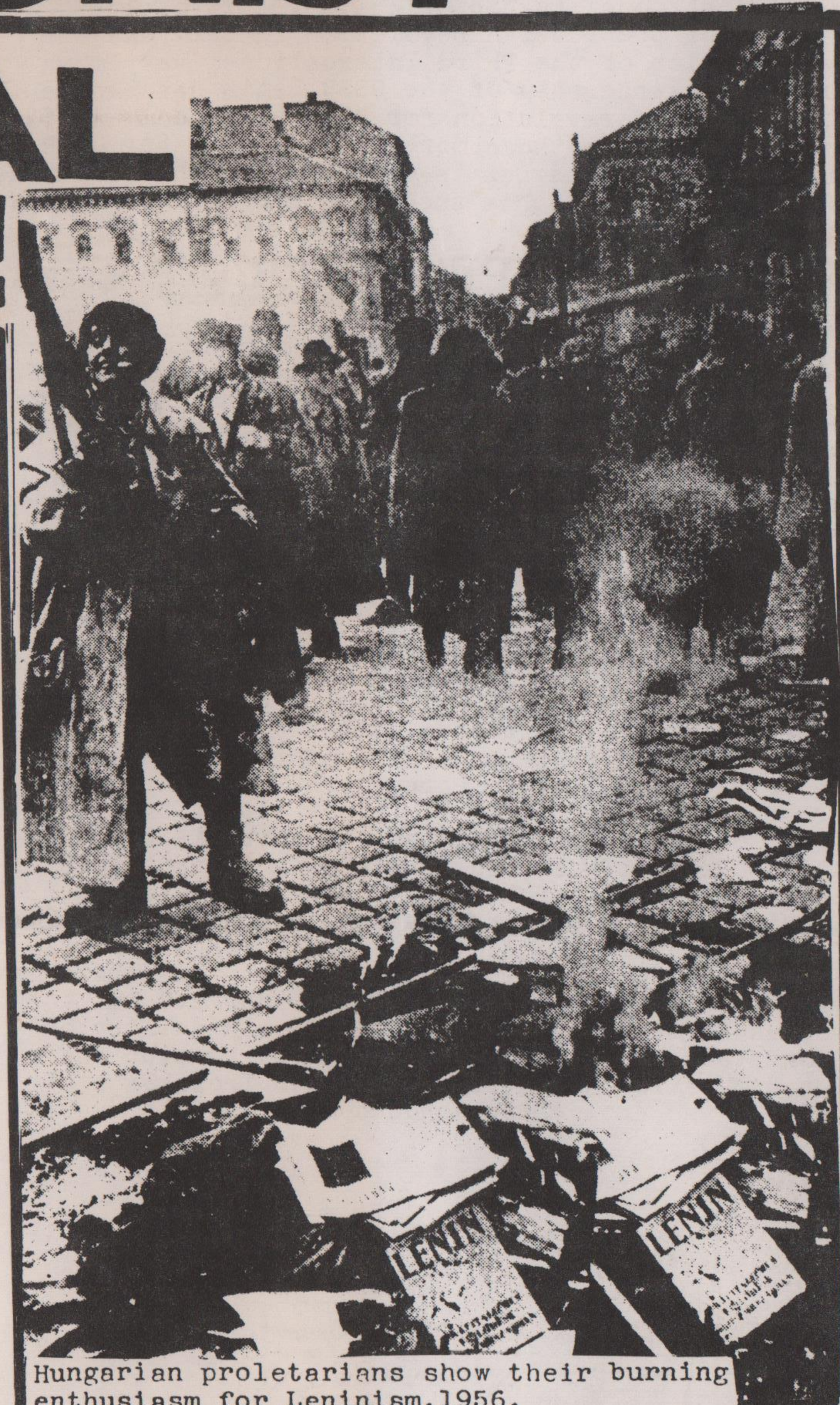
Hungarian proletarians show their burning enthusiasm for Leninism. 1956.

Over the years there has been much talk about workers councils. We have no objection to these, after all Lenin once said "All power to the soviets!" Of course what he meant and we mean is "All power to the soviets until the Party, objectively and historically embodying the interests of the working class, takes over the State!" but this has never proved so popular as a slogan. The workers councils are simply stepping stones for the Party. They couldn't run things, they have far too many workers and not enough Party cadres. This is obvious to those who have no illusions.