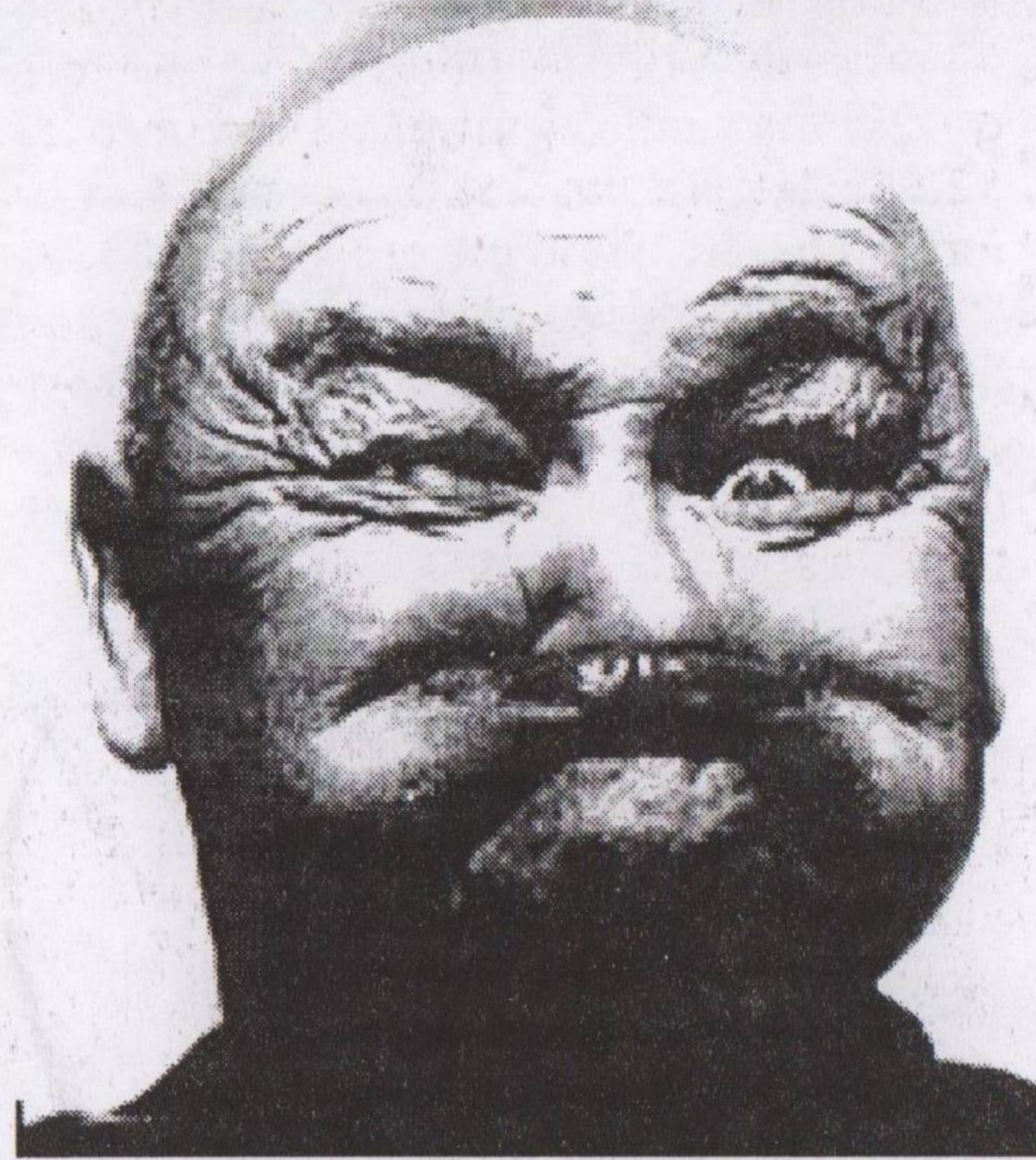
Artists impression of a SWP full timer, speaking at a recent meeting