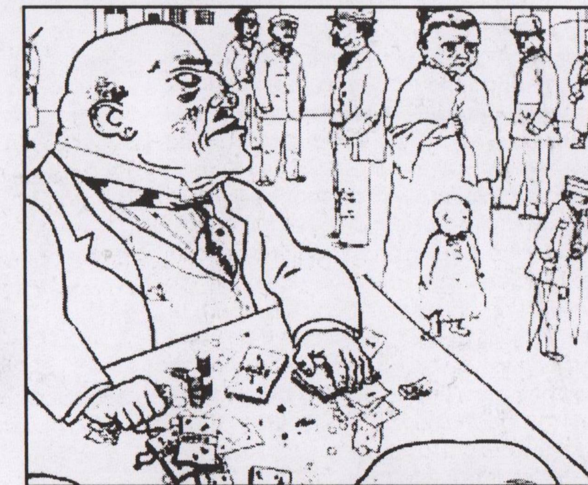
NHS - run by the ruling class, treats us like filth

Harold Shipman was able to kill people for years because of the system of authority on the one hand by medical professionals and accepting submission by everyone else. Shipman is a symbol of the whole system. It must be destroyed ★