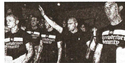
Recruitment leaflet for The 1992 ‘Battle of Waterloo’

Assemble: Saturday 12th September 1992 at 4.30pm Waterloo BR (Bring a Travelcard)