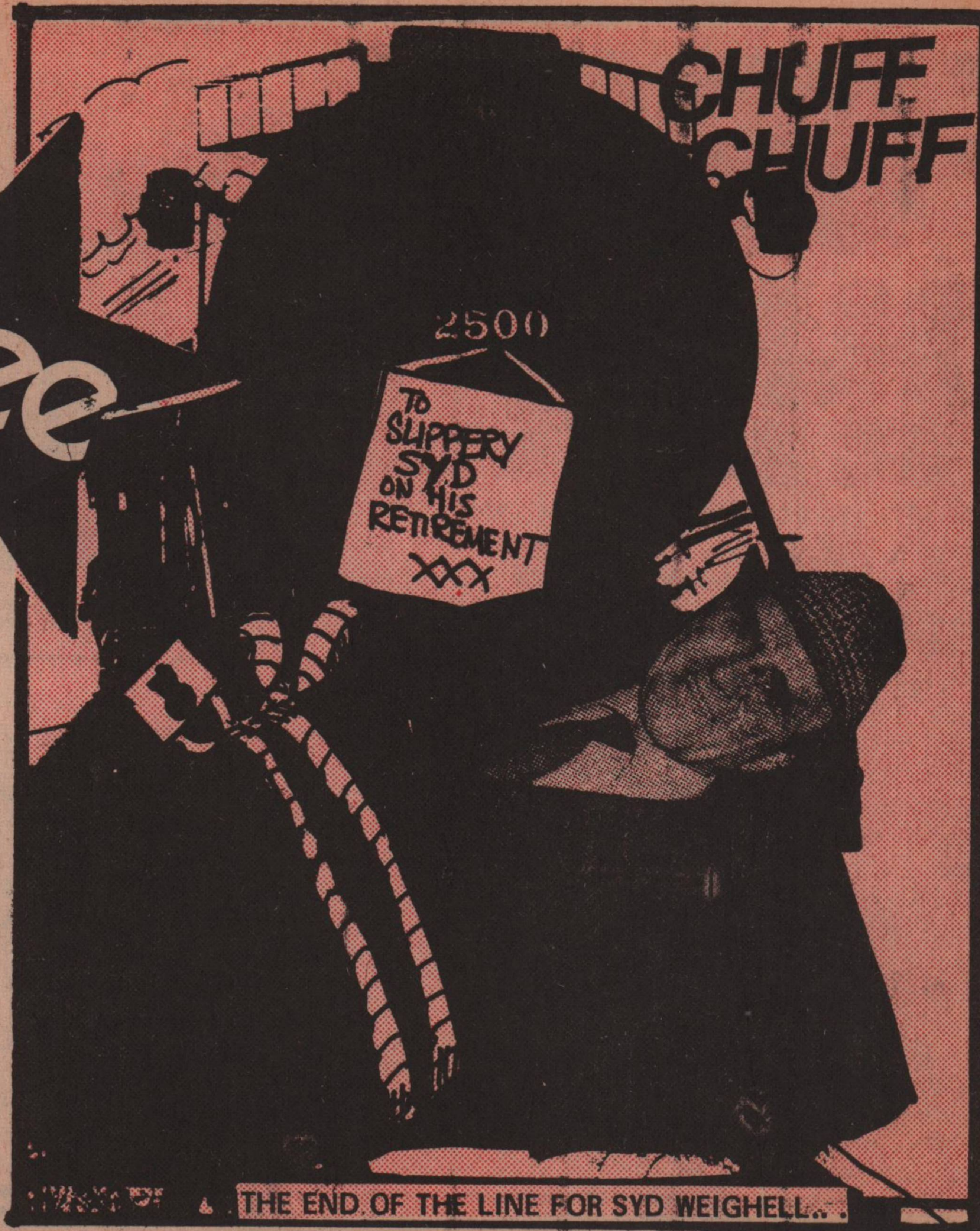
THE END OF THE LINE FOR SYD WEIGHELL..