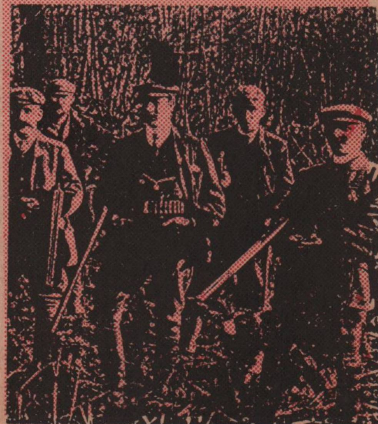
KELLY & CO.

Many local people will be giving a bodyswerve to Labour and all the other political parties. They've realised that the whole bunch are Traitors, Fakers and Frauds. And when it comes to the By-Election, they'll be saying 'Thanks, but No Thanks!'