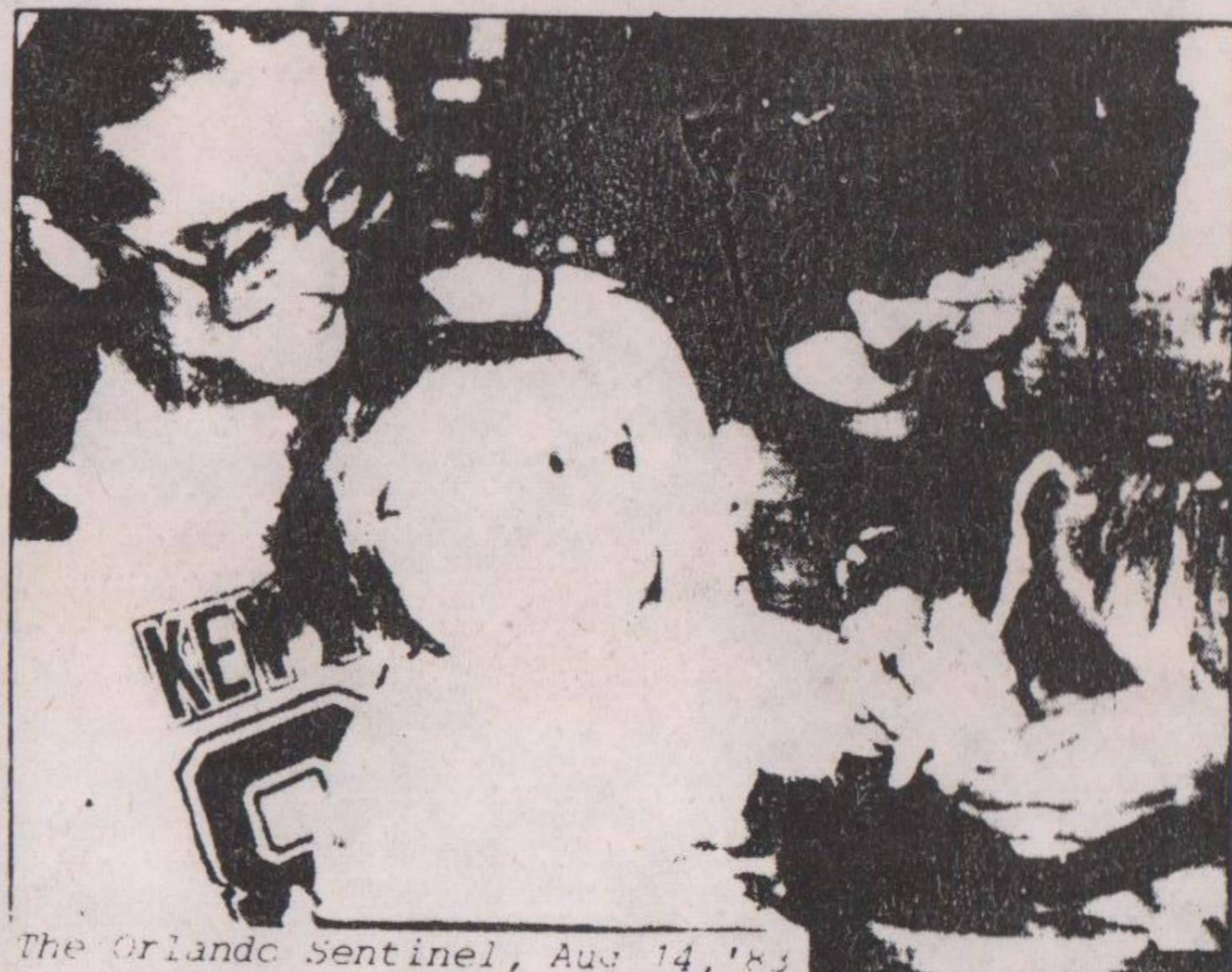
The Orlando Sentinel, Aug 14, '83

The Crime Prevention Panels are a device for actively incorporating people as police informers and controllers. Far from fostering a 'community' based on mutual aid and solidarity they attempt to sow the seeds of fear, distrust and passivity.