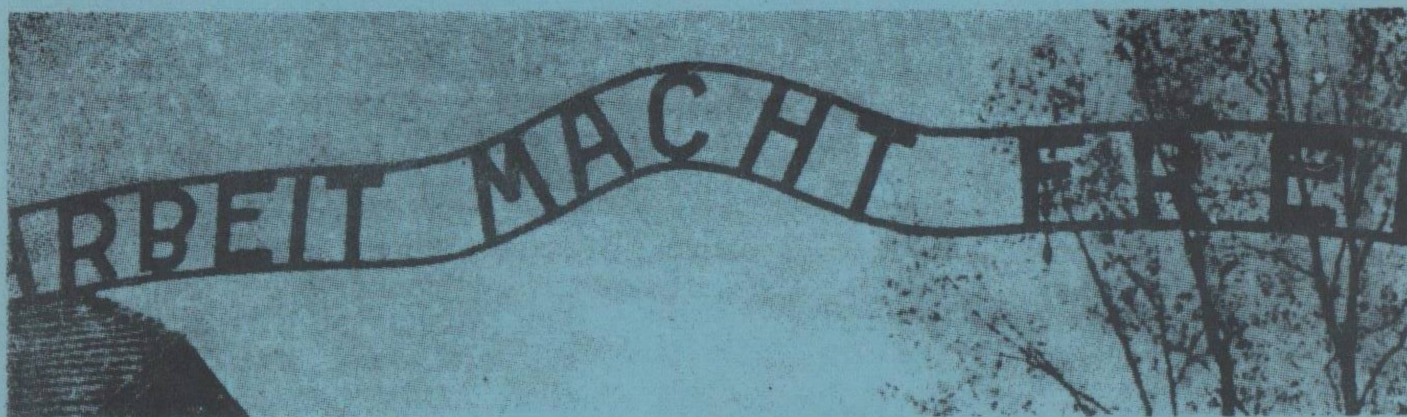
The truth of work: front gate of Auschwitz.

To the extent that automation and cybernetics foreshadow the massive replacement of workers by mechanical slaves, forced labour is revealed as belonging purely to the barbaric practices needed to maintain order. Thus power manufactures the dose of fatigue necessary for the passive assimilation of its televised diktats. What carrot is worth working for, after this? The game is up; there is nothing to lose any more, not even an illusion. The organization of work and the organization of leisure are the blades of the castrating shears whose job is to improve the race of fawning dogs. One day, will we see strikers, demanding automation and a ten-hour week, choosing, instead of picketing, to make love in the factories, the offices and the culture centres? Only the planners, the managers, the union bosses and the sociologists would be surprised and worried. Not without reason; after all, their skin is at stake.