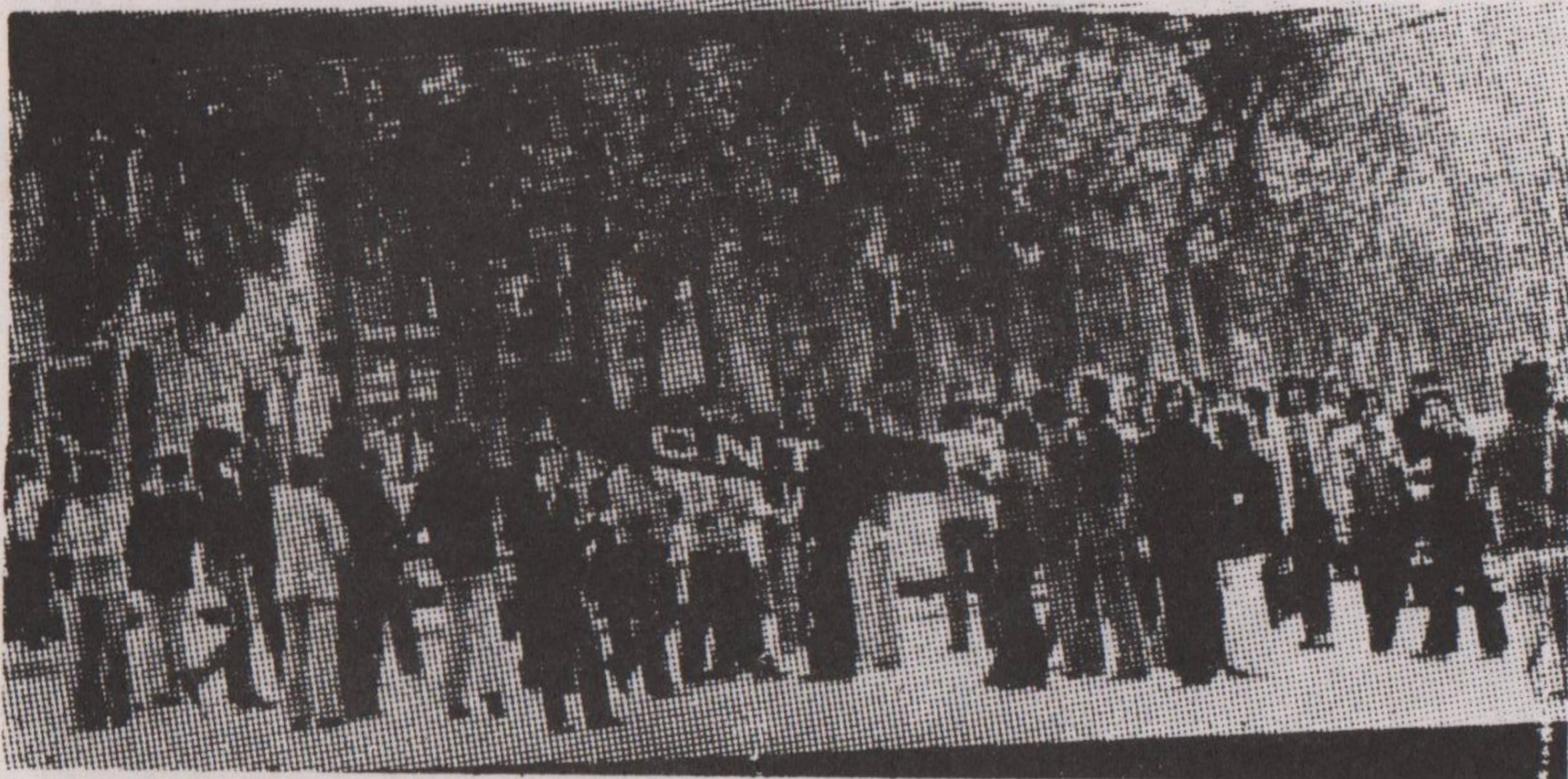
Defying 10 year prison sentences, CNT comrades march through Barcelona on May Day 1976

Fellow workers: please send a donation - even $1 - to help the desperate situation of our imprisoned CNT comrades and families ... in other words, its time to translate your beliefs into action.