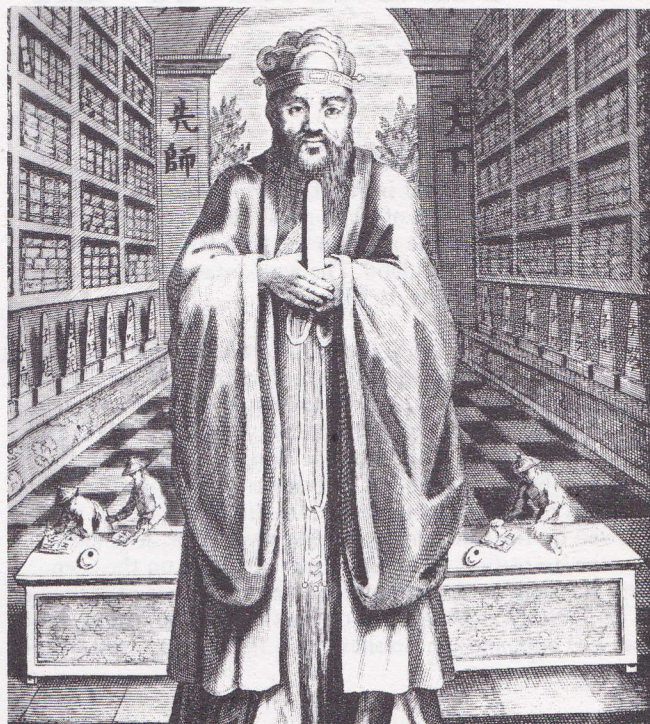
The philosopher Confucius

Yang can thus be interpreted in different ways, possibly because his philosophical contribution to an actual struggle suffers from the contradictions of the struggle itself. Another possibility is that these contradictions are either the pure consequence of the special Party-philosophical jargon, or