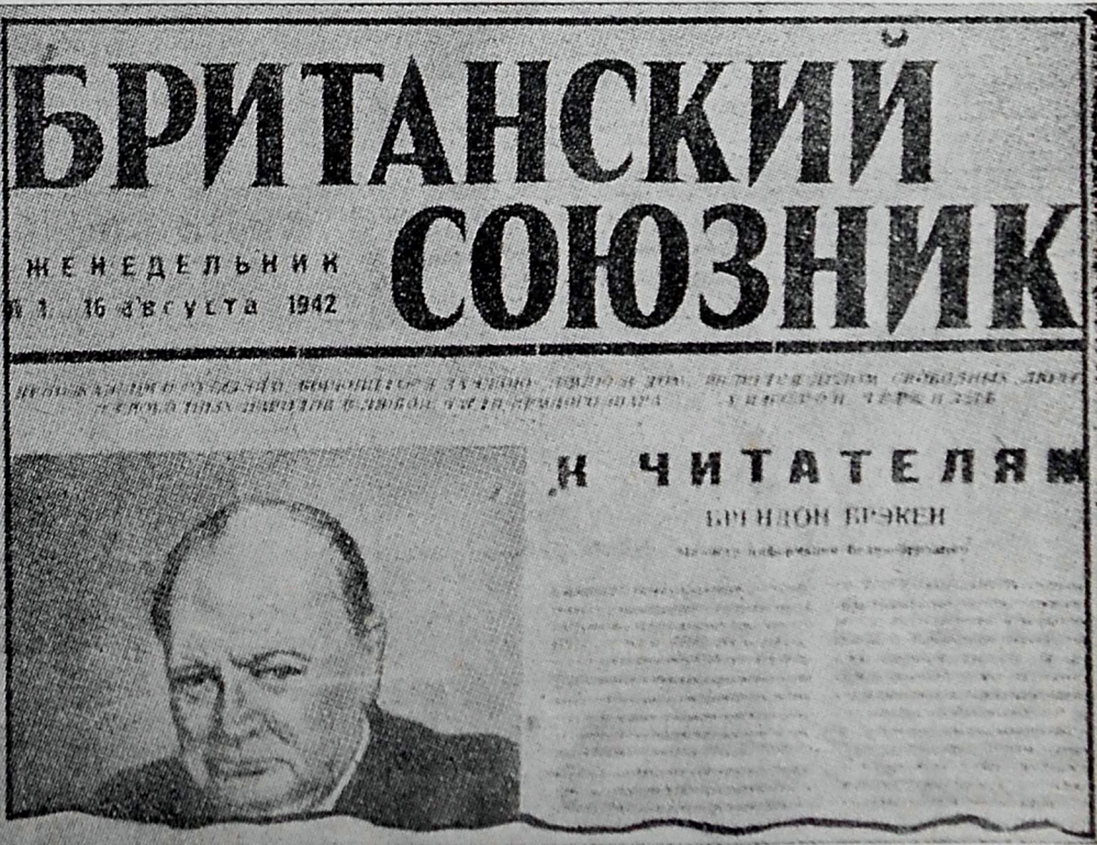
On August 14, 1942, Winston Churchill reaches Moscow for a 4 days' Anti-Nazi Conference with Stalin at the Kremlin.

The Ribbentrop pact was defended by the "Communist" Parties throughout the world as a pact of peace until Hitler invaded the Soviet Union. In support of this pact the "Communists" organised People's Peace Conventions. Nevertheless, the pact was a pact for war and not a pact for peace. Whatever may be the deeper social and economic causes of the Second World War, the 1939 Moscow agreement freed Germany for war and so made the present terrible clash inevitable. Our sympathy with the common people of the Soviet, our condemnation of