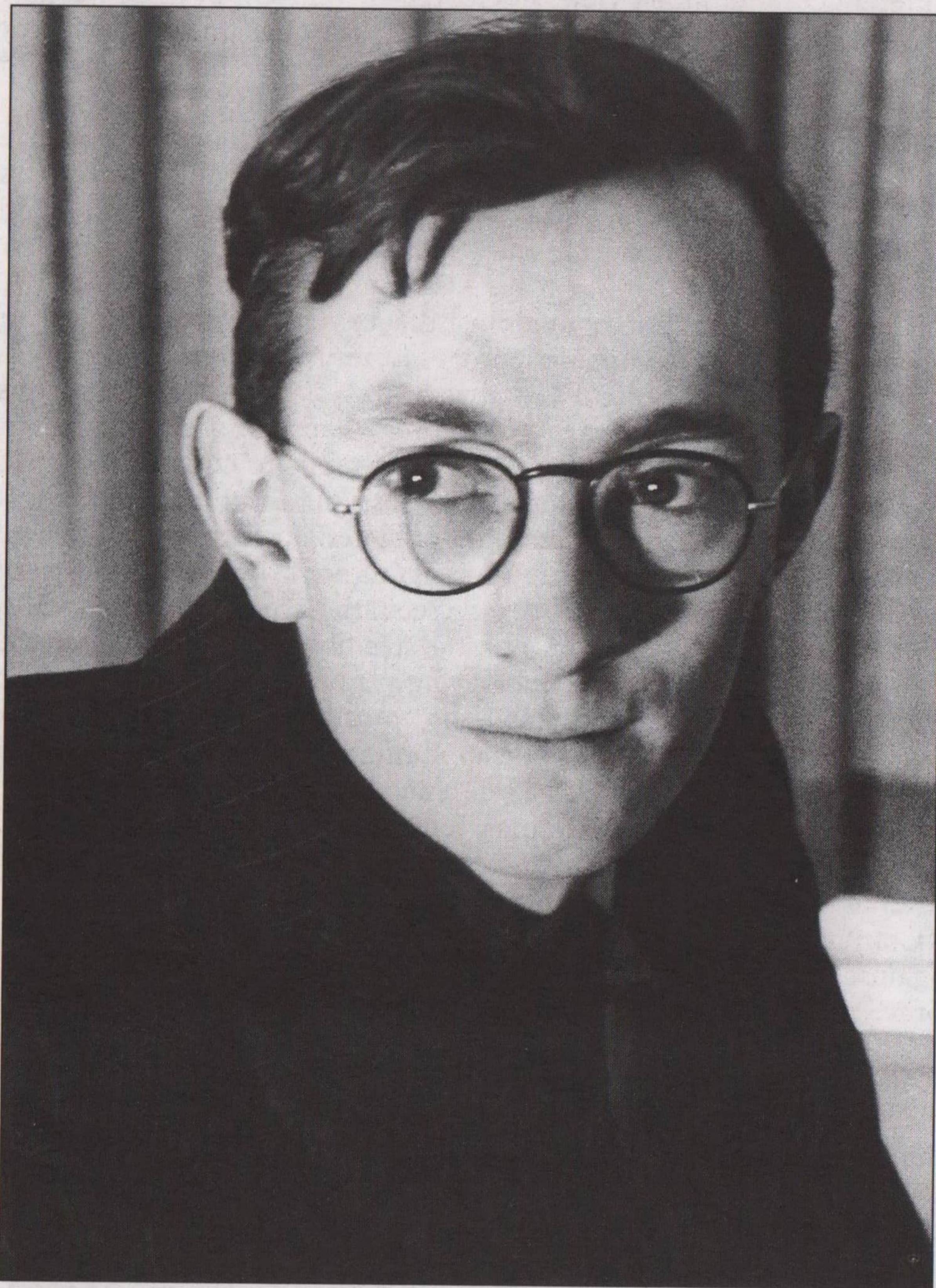
Alex Comfort, born 1920